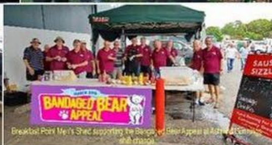
Breakfast Point Men's Shed supporting the Bangladesh Appeal at Ashford Community Centre